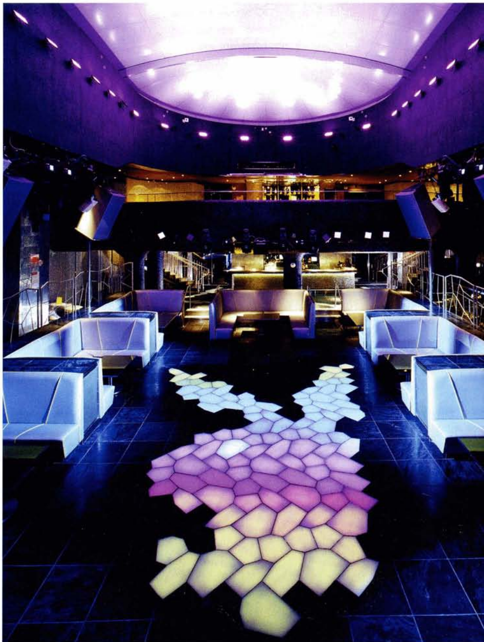
When Moon's roof is closed, space-like imagery is projected on the surface – all above the lunar-inspired (and Playboy bunny logo-inspired) dance floor.