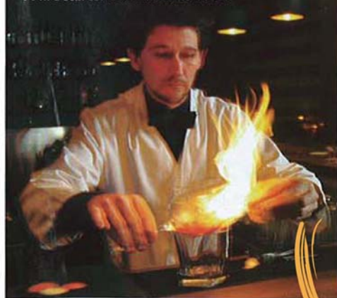
Right